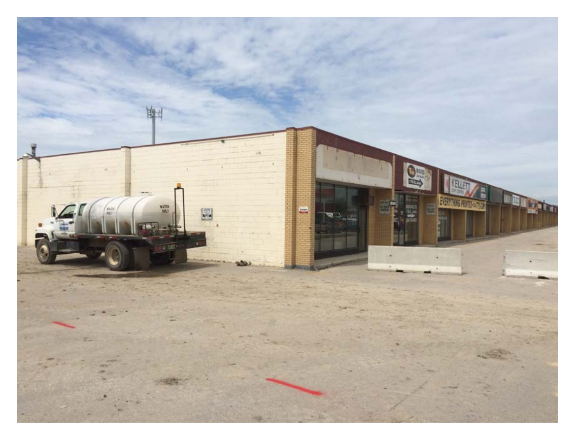
South East Corner of 914-950 St James Ave