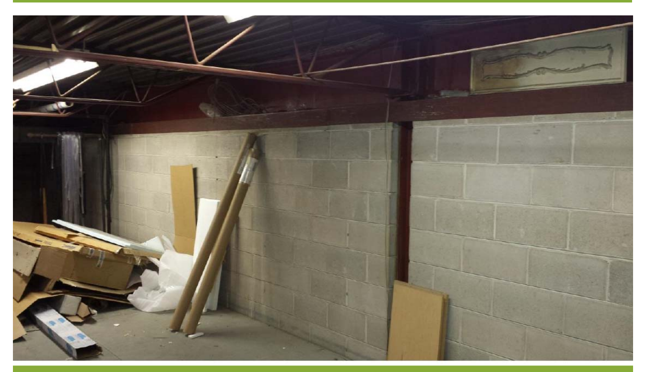
Photo No. 3: Non-load bearing masonry wall between Bays #1 and #2. Similar construction throughout other bays.