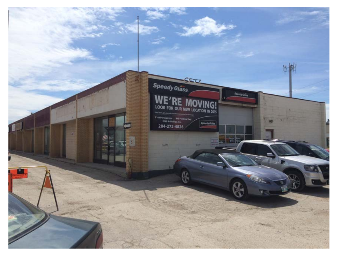
Northeast Corner of 914-950 St James Ave

Template Version: D320150806 - Demolition LR