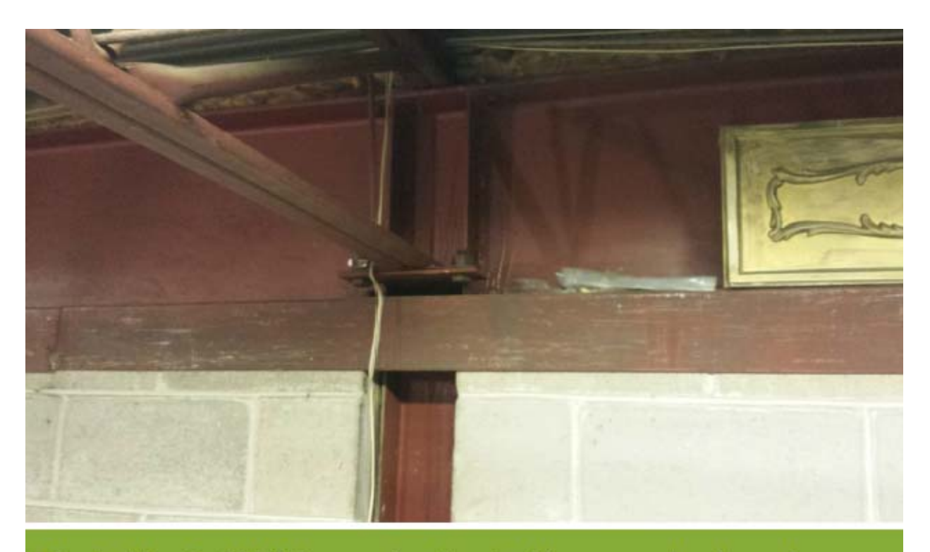
Photo No. 2: OWSJ spanning to steel beam and column between Bays #1 and #2.